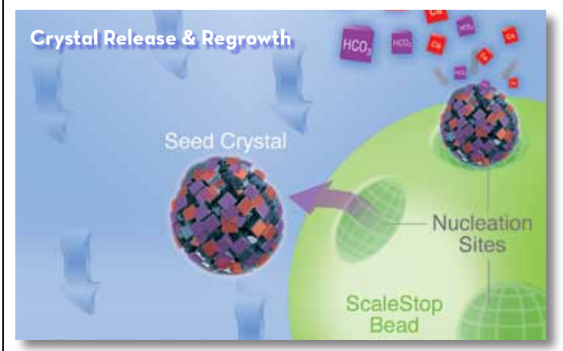
Once the crystals grow to a certain size they are released from the bead. The crystals in solution keep the hardness out of the water so that it can't form scale or interfere with soap.